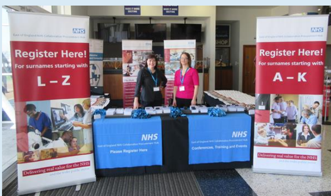
Above: Hub stand at the conference

The Hub hosted its 6 th and largest national conference on the subject of temporary agency staffing on 22 nd March 2017 and over 300 stakeholders and suppliers from all over the country attended.