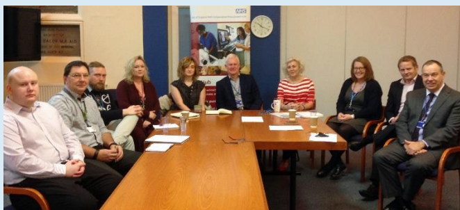
Cambridge University Hospitals Procurement Team meeting Hub staff at our Fulbourn office.